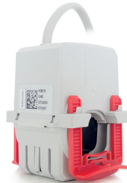
Cable split core current transformer